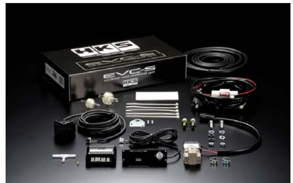
[Configuration of the units]