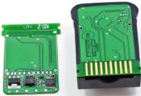
CJport expansion module

Injectronic introduced its CJPort™ platform to increase the capabilities of its automotive diagnostic equipment. Built from the ground up to simplify hardware and software expansion, the CJPort platform provides a simple and elegant method for adding plug-and-play capabilities such injector testers, information systems, enhanced data, data recording, new protocols, wireless communications and more to the CJ4 Scantools. A primary component of the CJPort platform, the CJPort expansion slot, shipped today on CJ4 OBDII Scantools. With the CJPort slot, people can simply plug in CJ4 expansion modules that will range from injectors testers to mass data storage.