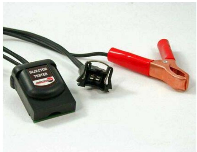
Injector tester. Hardware and software expansion sample