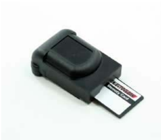
Optional MMC card slot