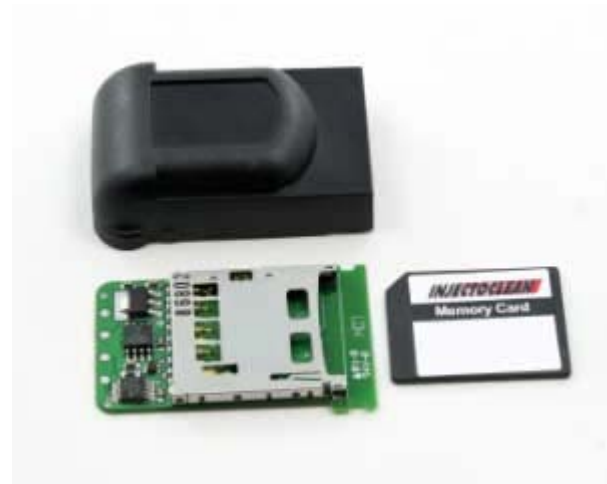
CJPort module with optional MMC card